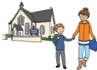
Come home from school